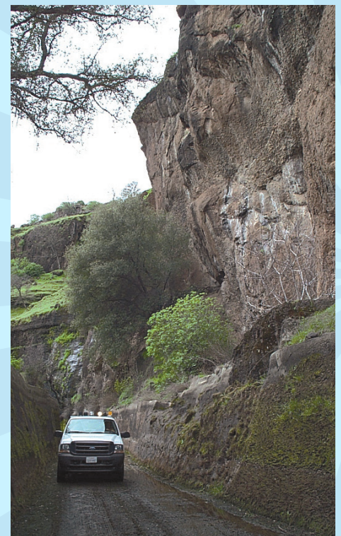
A mile-long tunnel would replace this 100-year-old canal east of Knights Ferry.

“It’s a significant threat,” he said. “We have $8 million saved already. If we put another $6 million or $8 million into the fund this year, and the same next year, we’re there as far as paying for the tunnel. We anticipate using water sale revenues over the next three years to fully fund this project.”